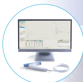
BTL CardioPoint SPIRO